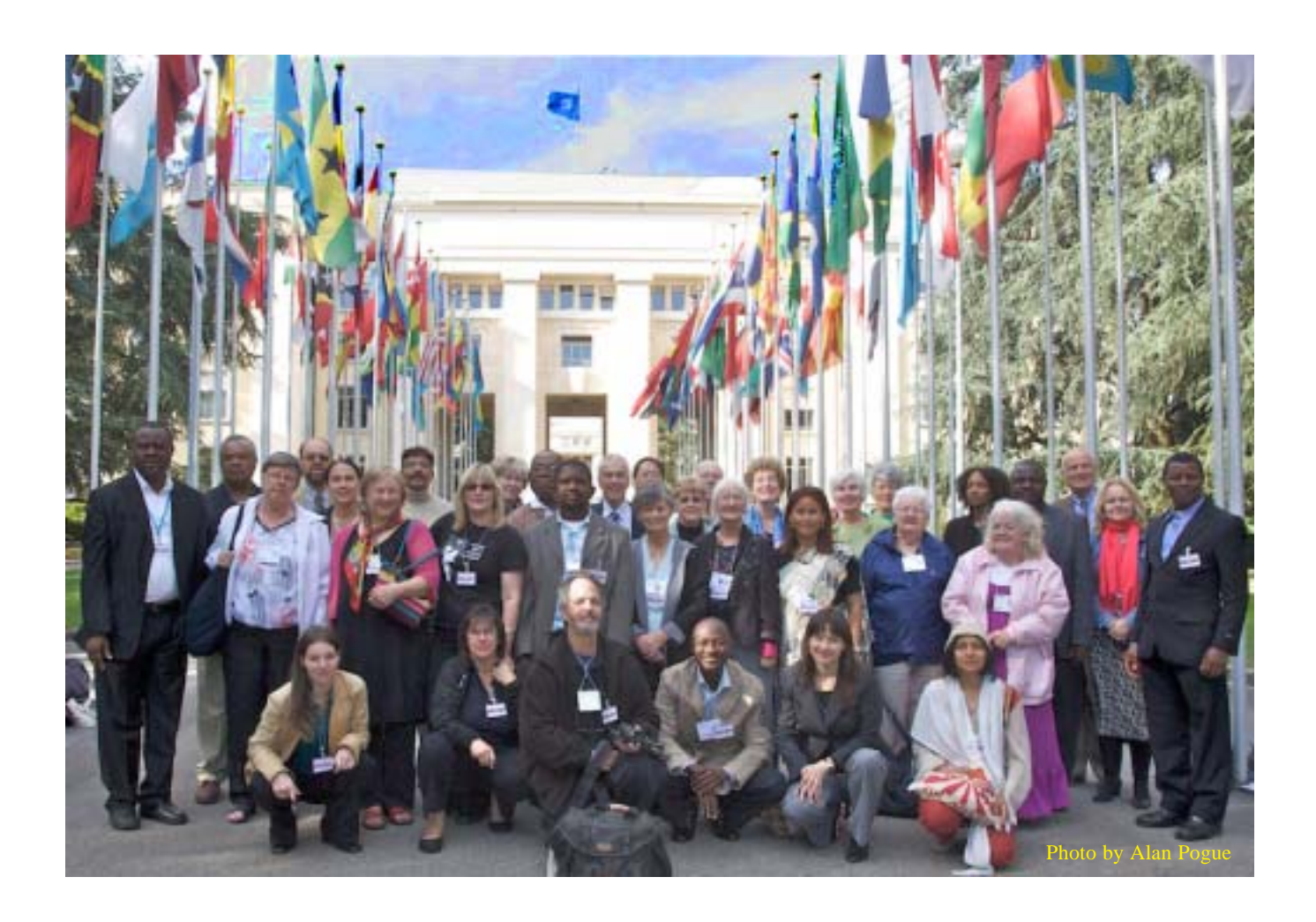
4th International Conference, Human Rights & Prison Reform, June 21-24, 2009, Geneva, Switzerland